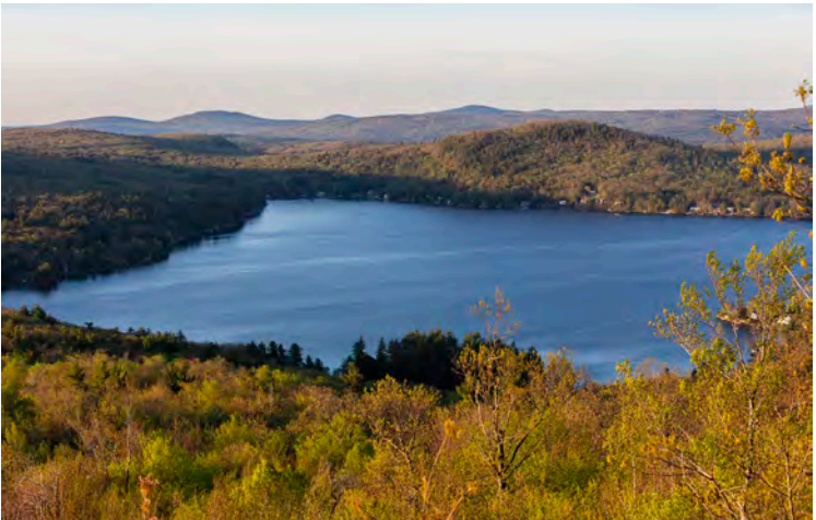
Great views of Merrymeeting Lake await from the top of Mount Molly

Thank you to the Collins family for their extraordinary gift and to members of the community for the outpouring of support and donations to make the Collins Family Forest a reality.