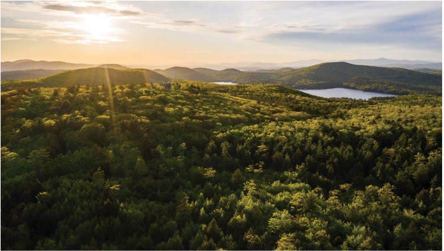
Looking northwesterly, across Birch Ridge, with Merrymeeting Lake just beyond the forest.